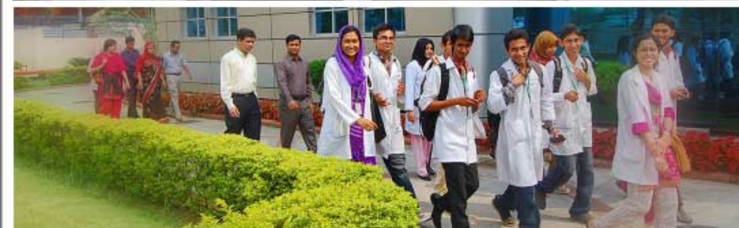
Representative Office - International MBBS Program